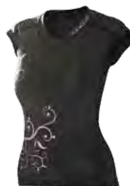
Lavender Hedera ♀